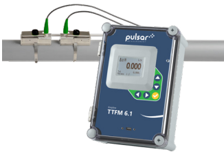
Greyline TTFM 6.1 Transit-Time Flowmeter