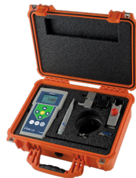
Greyline PTFM 1.0 Portable Transit-Time Flowmeter