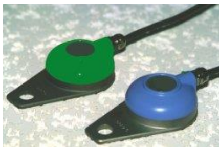
Pulsarguard 2010 (green) and 2011 (blue, hazardous area approved)

The 201x series sensor uses state of the art soundwave technology to detect change in structure borne acoustic emissions from equipment and materials in motion.