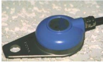
Hazardous area version (blue)

(Reference European ATEX Directive 2014/34/EU, Annex II, 1.0.6.)