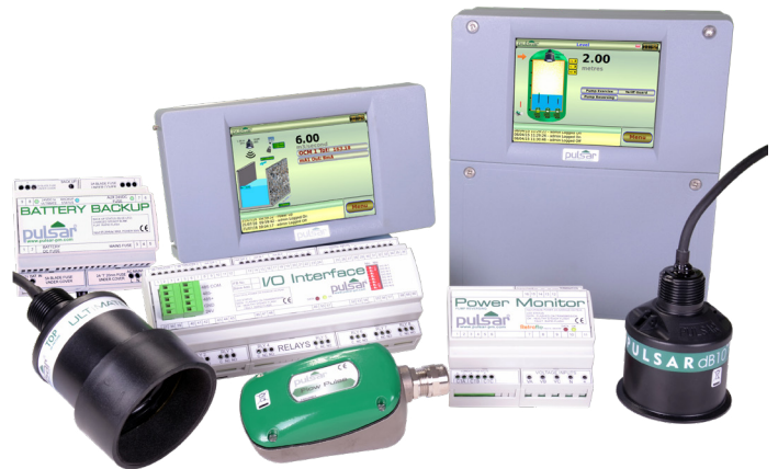
The Ultimate Controller Flow Group of Accessories

Ultimate also offers options Wi-Fi connectivity allowing you to access, program, and interrogate the system wirelessly.