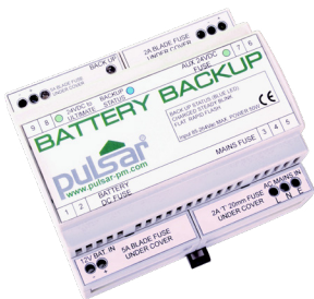
The Ultimate Controller Battery Backup Module

From Tariff Management to minimize your energy costs to Burst/Block alarms to Pump Prioritization based on efficiency. Pulsar Measurement's Ultimate Controller is packed with the advanced control features that bring effortless sophistication to pumping stations, meaning every installation can benefit from Pulsar Measurement's wealth of experience.