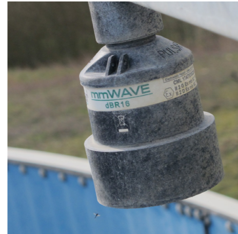
dBR16 on a foamy aeration tank.

Radar measurement will produce more stable results than ultrasonic sensors with limited acoustic power on foamy applications. This is because the foam interrupts the signal of the ultrasonic transducer; you can still get around this issue with ultrasonic measurement by using a sensor with high acoustic power. However, one thing that both technologies have in common is that it is virtually impossible for them to see through the foam to the liquid surface.