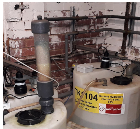
dBR8's reading through the plastic lid of a chemical tank.

One of the long-standing issues with ultrasonic measurement is that it has struggled with the inability to measure reliably within the methane-rich, elevated temperature, and pressurized environment of a sludge digester. With businesses all over the globe making a huge effort to be more environmentally friendly, with bio-gas generation; radar measurement offers an easy way to measure levels within the digester's and with a standard set of communications and protocols that communicate with the rest of the site.