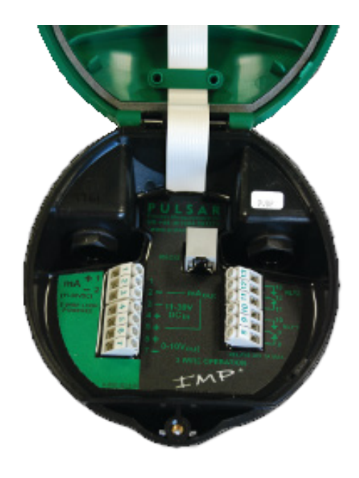
Inside the lid of an IMP Lite