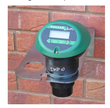
Optional mounting bracket for IMP sensors