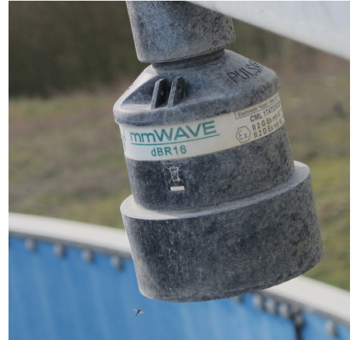
dBR16 on a foamy aeration tank.

Radar measurement will produce more stable results than ultrasonic sensors with limited acoustic power on foamy applications. This is because the foam interrupts the signal of the ultrasonic transducer; you can still get around this issue with ultrasonic measurement by using a sensor with high acoustic power. However, one thing that both technologies have in common is that it is virtually impossible for them to see through the foam to the liquid surface.