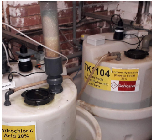
dBR8's reading through the plastic lid of a chemical tank.