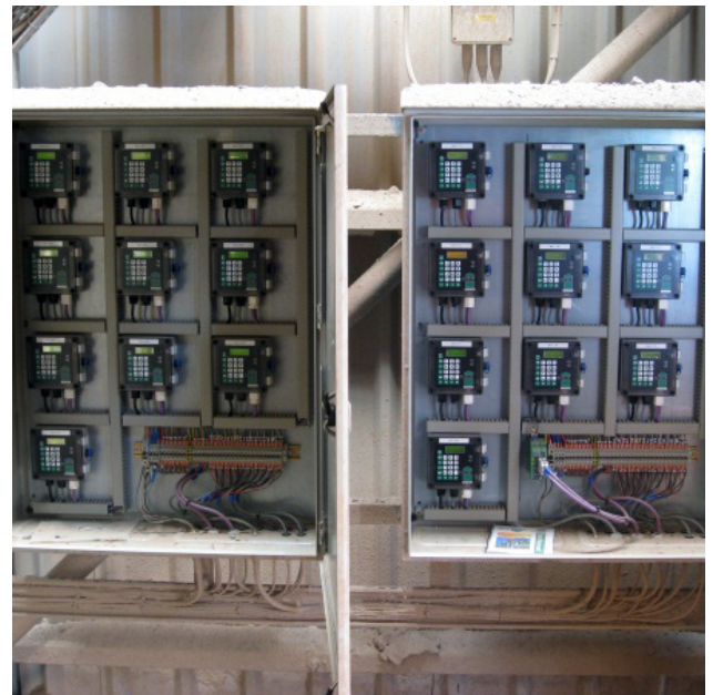
20 Blackbox Units housed in control cabinet.

The system of choice for this site was the Blackbox controller accompanied with the dB15 Transducer Series, the Blackbox is compact and easy to install, a useful timesaver for the site was the ability to clone several of the units using the same programming parameters. As the silos were all a similar size, they could all be pre-programmed before installation, which reduced process downtime. The 20 Blackbox units, two for each silo, were mounted in a control cabinet, and each connected to a Pulsar dB15 Transducers mounted on an aiming kit so that it could be directed towards the silo draw-off point. The units were then multiplexed through a Profibus connection to the site SCADA system.