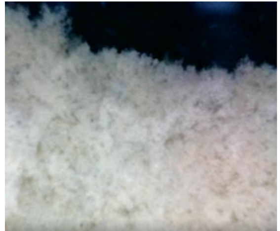
Image of the application from the underwater camera

The Pulsar Measurement Sludge Finder 2 has a standard in-built high floc alarm feature. The intrusion window for the application appears in the top left corner of the echo profile display and is an indicator that can be tailored and programmed according to different site conditions. The unit can pick up on high floc level readings and the intrusion window acts as an indicator that shows if the floc level is reaching the alarm stage.